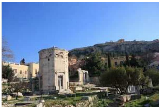
Tower of winds, Athens