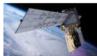
Understanding Earth's winds

EarthCARE carries an instrument package, which includes a high-spectral resolution atmospheric lidar, to acquire vertical profiles of clouds and aerosols as well as radiances at the top of the atmosphere to improve our understanding of Earth's radiative balance.